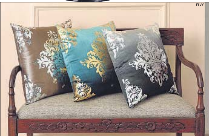
Warm metal shades like gold, brass, bronze and copper contrast well with cooler shades such as steel, nickel, silver, white gold and aluminium.

steel with beaten copper, or chrome with pink gold can create an interesting look. If you are wary of how two or more opposing shades will react together, simply go the ombre route — marry vary-