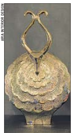
A showpiece in gold reflects light in different ways.

with natural elements such as wood. Make sure that the colour tones complement each other," says Rungta. "Black and chrome work well with wooden tones. Dull brass works wonderfully with textured hardwoods whereas polished copper and mirrors complement each other," says Dinshaw. You can also consider throwing in marble, stone, velvet and other fabrics to the mix to maintain the right balance of elements in the look.